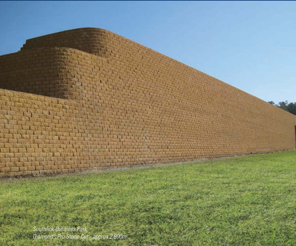
Southlink Business Park Diamond® Pro Stone Cut - approx 2,800m 2

Solutions for Design > Supply > Installation > Certification