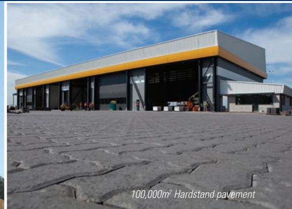
100,000m 2 Hardstand pavement