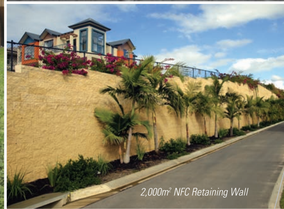
2,000m 2 NFC Retaining Wall

Adbri Masonry is Australia's leading masonry manufacturer and a division of Adelaide Brighton Ltd. For over 20 years our experienced Contracting Services team has built a reputation for supporting designers engineers and contractors with proven solutions for civil, commercial and industrial projects. We specialise in Gravity, Geogrid and No Fines Concrete walls, industrial hardstand pavements and erosion control solutions.